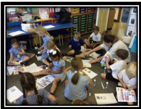
Money Sense KS1 and KS2